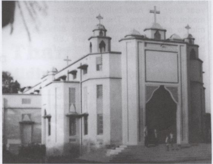
The Buxar Church-- now a Cathedral