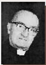
April 15, 1996 Colombiere Jesuit Community Clarkston, Michigan