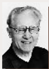
May 9, 1996 Colombiere Jesuit Community Clarkston, Michigan