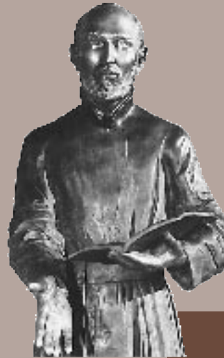
The statue of St. Ignatius Loyola that fronts Brebeuf Jesuit Preparatory School.