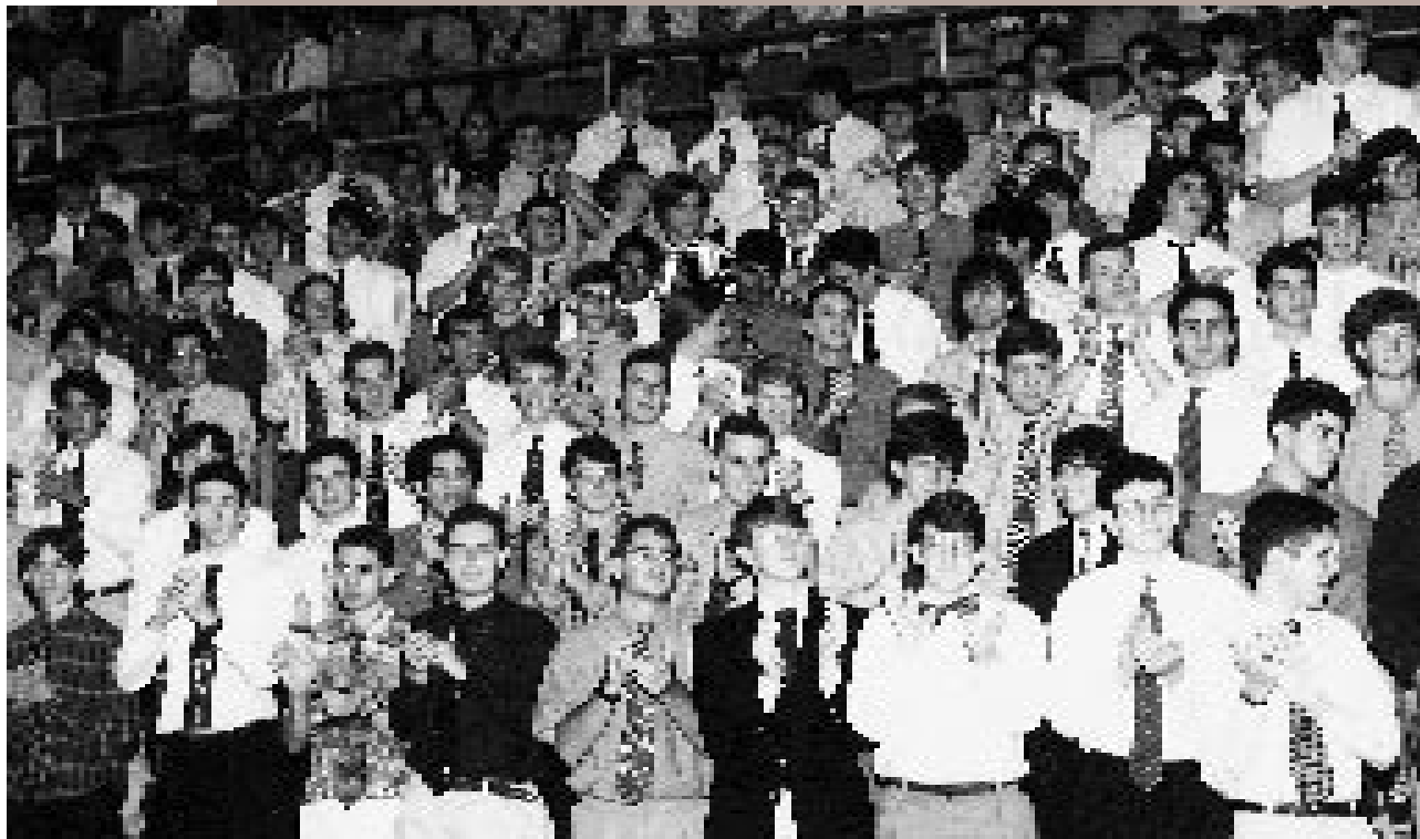
Students at St. Xavier High School welcomed Fr. Kolvenbach at an all-school assembly.

bach celebrated the Eucharist with the Jesuits from the Lexington area at St. Xavier High School. After breakfast with them, he was then given a tour of the high school. The student body welcomed him with thunderous applause at an all-school assembly. From St. Xavier, Fr. Kolvenbach went to Milford Spiritual Center, toured the facilities there and then met for lunch with the superiors and directors of Jesuit works in Cincinnati.