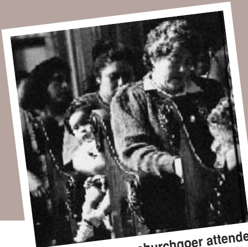
A curious young churchgoer attended the Hispanic liturgy at St. Procopius.