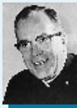
September 16, 1995 Colombiere Jesuit Community Clarkston, Michigan

Since 1983, he served as a spiritual director at Trinity House, a day-treatment center for religious men and women situated south of Chicago's Loop. He had also served as vice president of the board of directors of the Foundation for Trinity House and as a chaplain at Chicago-area Veterans Administration hospitals.