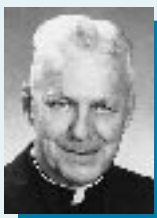
December 28, 1995 Xavier University Jesuit Community Cincinnati

He was a member of numerous organizations, including the United World Federalists. During the 1960s, he actively opposed the war in Vietnam. He retired as professor of philosophy in 1980. In 1986 he joined the Colombiere Jesuit Community.