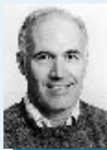
November 3, 1995 Clark St. Jesuit Community Chicago