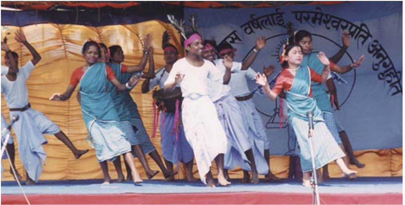
Deonia Jhapa East Nepal tribal dancers from the parish youth group

which presented an opportunity to remember and celebrate not just the worldly accomplishments of these pioneers, but also, as Emerson said, what lies within them: their spirit, their devotion, their character, and their love for the people they served.