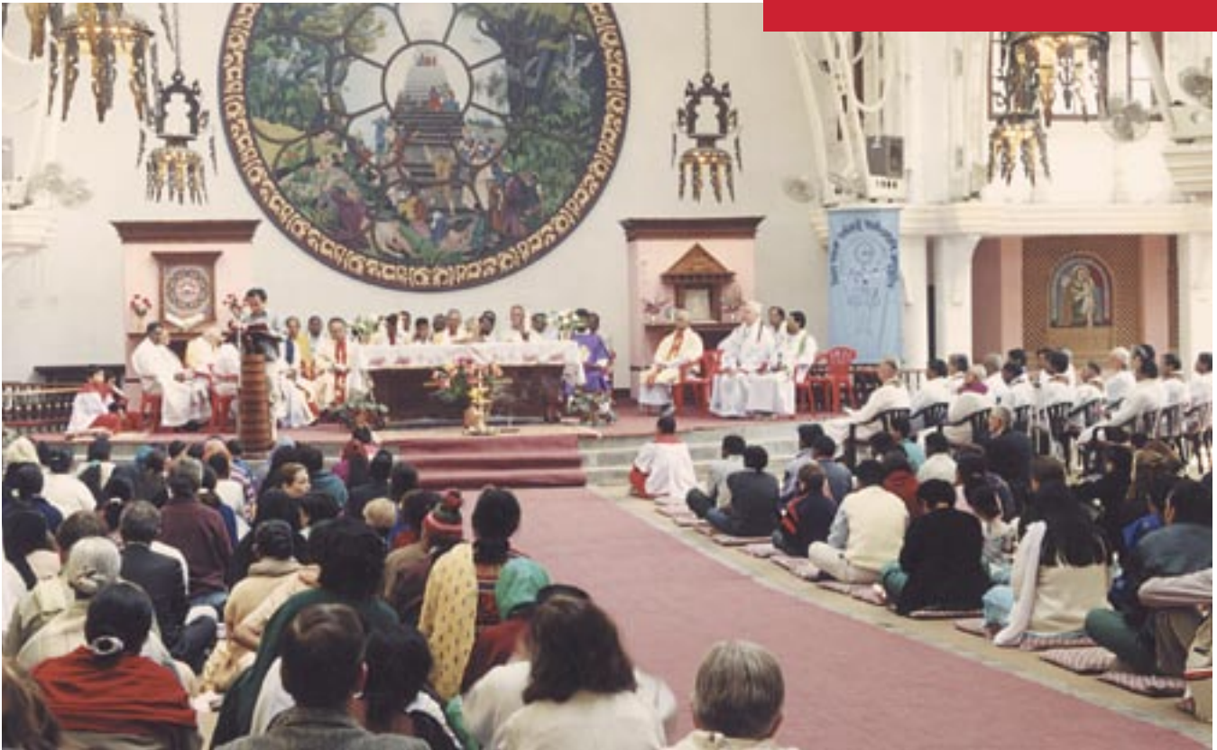
Altar with concelebrants: more than 50 seated at right off altar platform with laity seated Nepali-style on cushions. Nepali ceiling lamps hanging. Jacob's ladder backdrop wall painting.