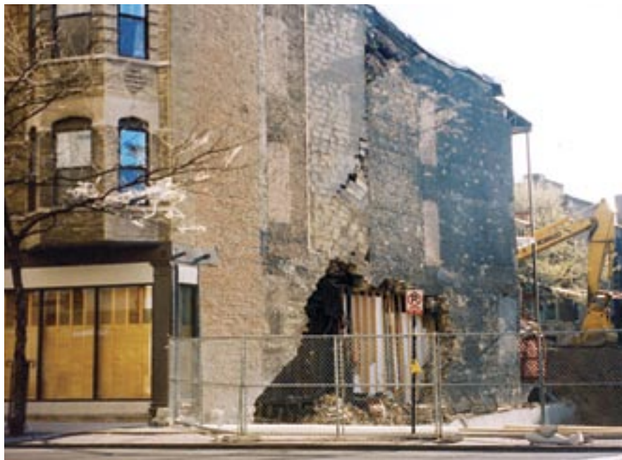
The Clark Street Jesuit Residence Saturday afternoon before the City of Chicago demolished the partially collapsed building.

O n the afternoon of Saturday, April 26, 2003, the north wall of the Clark Street Jesuit Residence, located immediately north of the Chicago Province Office, gave way and appeared as if it might collapse. The Jesuits in the building notified police and fire crews who immediately secured the area. At 9:00 P.M. a city of Chicago building inspector deemed the 120-year-old building to be in imminent danger of collapsing and directed that it be razed.